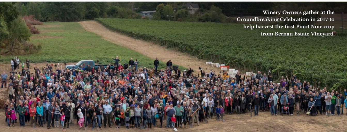
Winery Owners gather at the Groundbreaking Celebration in 2017 to help harvest the first Pinot Noir crop from Bernau Estate Vineyard.

Willamette Valley Vineyards became the first SEC authorized community-funded business in the U.S. through the first successful Regulation A self-underwritten public offering in 1989. The winery has grown with the support of wine enthusiasts through Preferred Stock Ownership (NASDAQ: WVVIP) funding new vineyards, wineries and experiences.