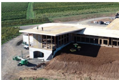
Bernau Estate construction in progress (April 2020).

Bernau Estate will produce world-class méthode champenoise sparkling wines with an underground aging cellar and biodynamically-farmed