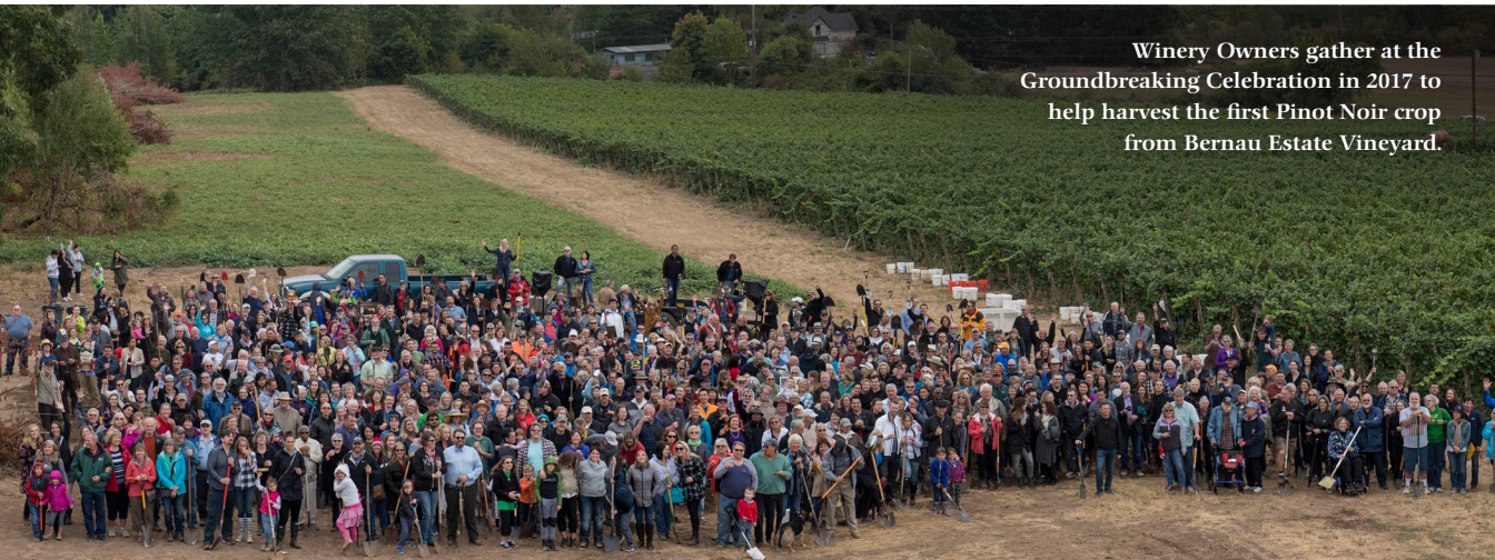
Winery Owners gather at the Groundbreaking Celebration in 2017 to help harvest the first Pinot Noir crop from Bernau Estate Vineyard.

Willamette Valley Vineyards became the first SEC authorized community-funded business in the U.S. through the first successful Regulation A self-underwritten public offering in 1989. The winery has grown with the support of wine enthusiasts through Preferred Stock Ownership (NASDAQ: WVVIP) funding new vineyards, wineries and experiences.