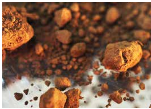
Jory, named after the homesteading family of the Salem Hills, is the dominant soil at Willamette Valley Vineyards and Elton. The shallower, volcanic soil on the upper portion of the slopes, Nekia, gives the Bernau Block its pronounced intensity, minerality and earthiness.