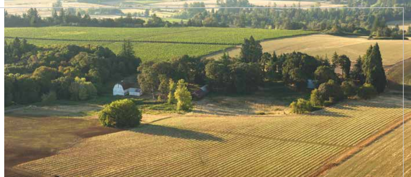
Bathed in the cool morning sun, Elton Vineyard is in the background. Our new plantings at Ingram Estate are in the foreground.