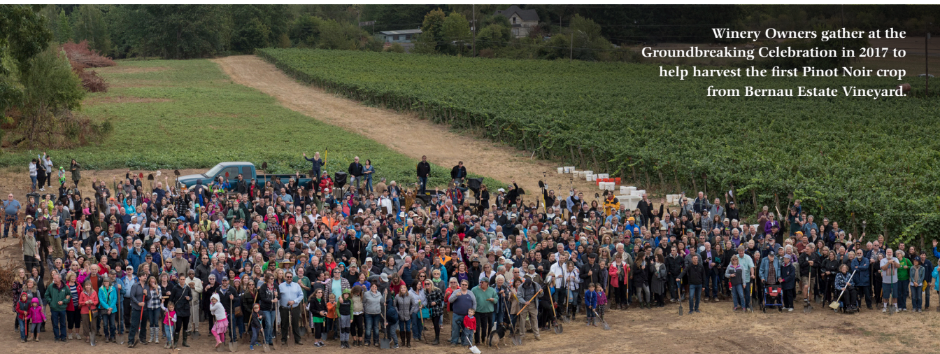
Winery Owners gather at the Groundbreaking Celebration in 2017 to help harvest the first Pinot Noir crop from Bernau Estate Vineyard.

Willamette Valley Vineyards became the first SEC authorized community-funded business in the United States through the first successful Regulation A self-underwritten public offering in 1989. The winery has grown with the support of wine enthusiasts through Preferred Stock Ownership (NASDAQ: WVIP) funding new vineyards, wineries and experiences.