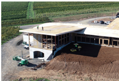
Bernau Estate construction in progress (April 2020).

Bernau Estate will produce world-class méthode champenoise sparkling wines with an underground aging cellar and biodynamically-farmed