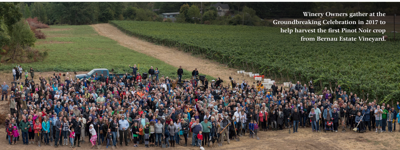
Winery Owners gather at the Groundbreaking Celebration in 2017 to help harvest the first Pinot Noir crop from Bernau Estate Vineyard.

Willamette Valley Vineyards became the first SEC authorized community-funded business in the U.S. through the first successful Regulation A self-underwritten public offering in 1989. The winery has grown with the support of wine enthusiasts through Preferred Stock Ownership (NASDAQ: WVIP) funding new vineyards, wineries and experiences.